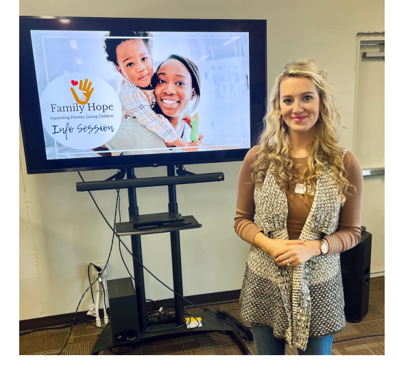
(Family Hope Info Session at Harvest Church)