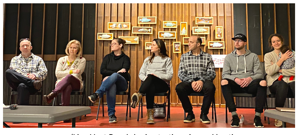
(Live Host Panel sharing testimonies and hosting reflections at Redeemer Presbyterian Church)